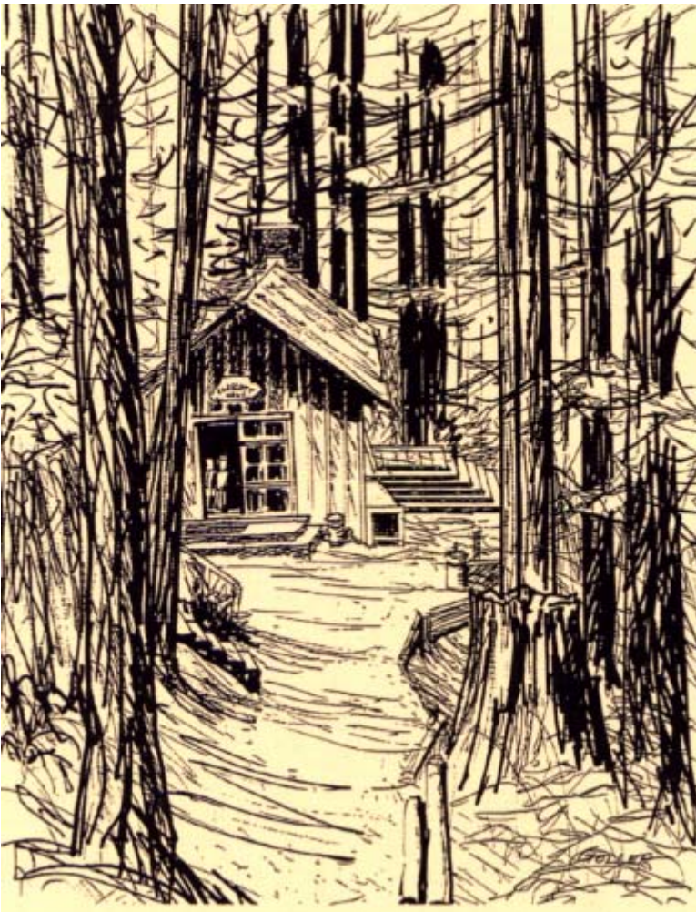
Looking towards the Dance Hall from the Dining Hall.