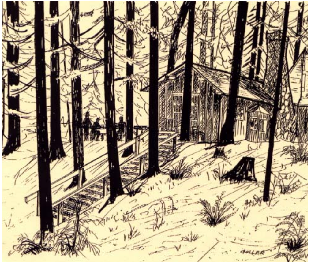
Dining Hall at Mendocino Woodlands. Ed Goller

Include 2 legal self-addressed, stamped envelopes.